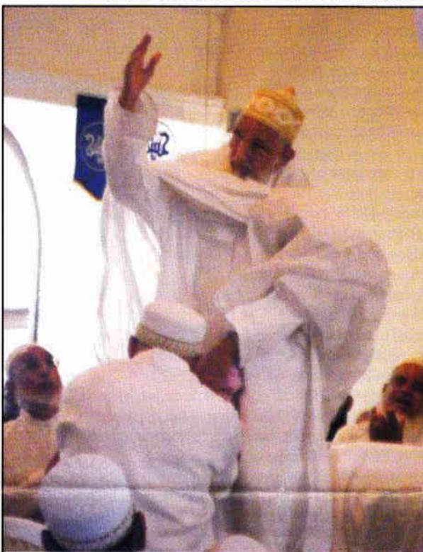
His Holiness Syedna (TUS) delivers religious sermon in Nairobi Syedna (TUS) arrived at Saifee Park, Burhani Masjid in Nairobi (Kenya) to preside over the Waaz Majlis on shahadat of Imam Hasan AS.